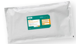
Bag with label