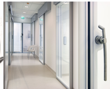
Fully Glazed Flush Door