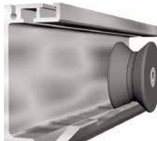
Patented Track System